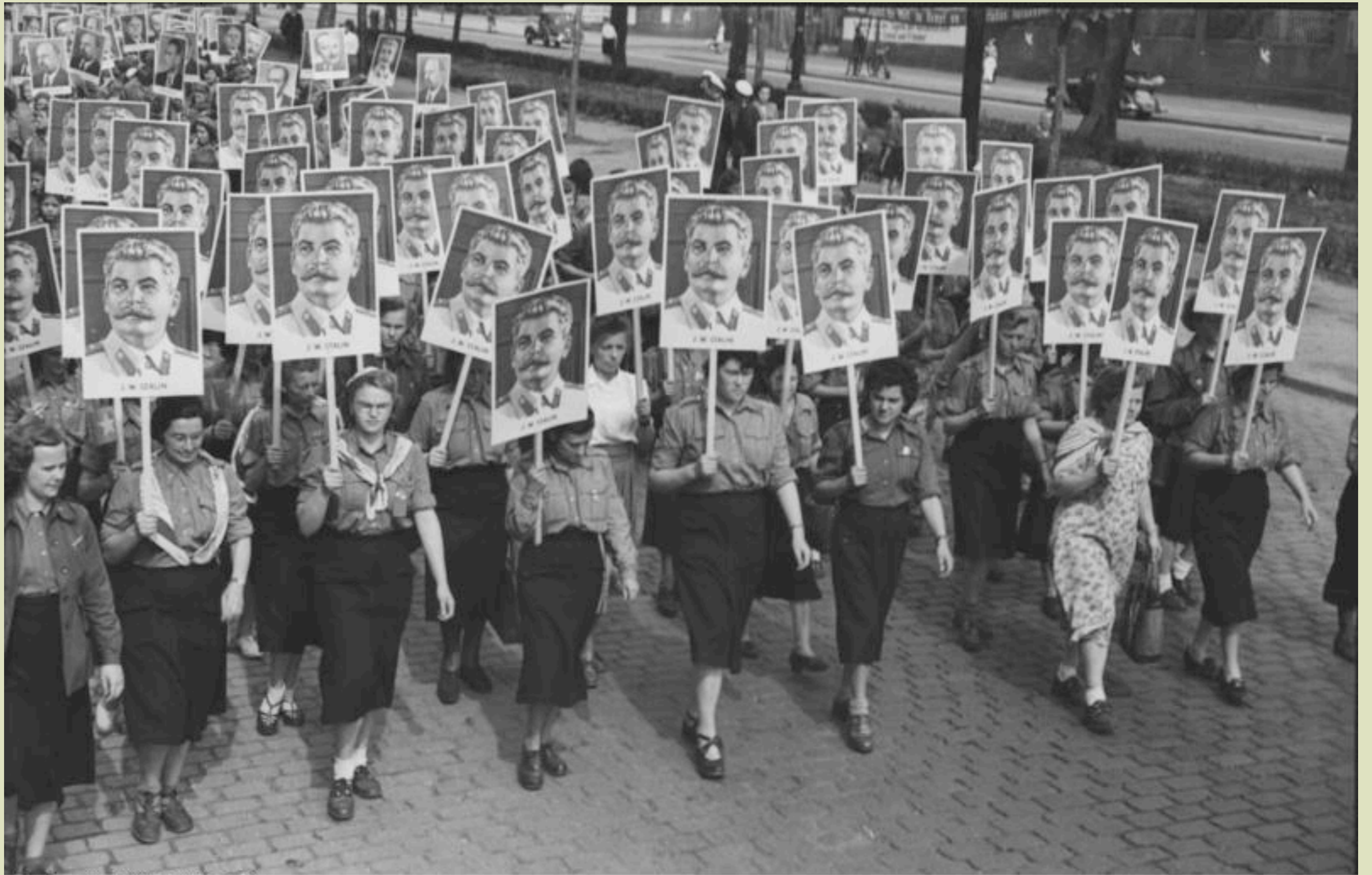
9. August 1951